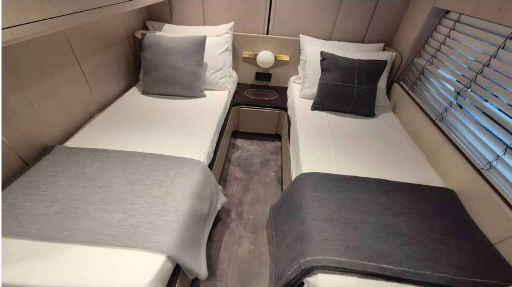
TWIN BEDROOM WITH PULLMAN BED