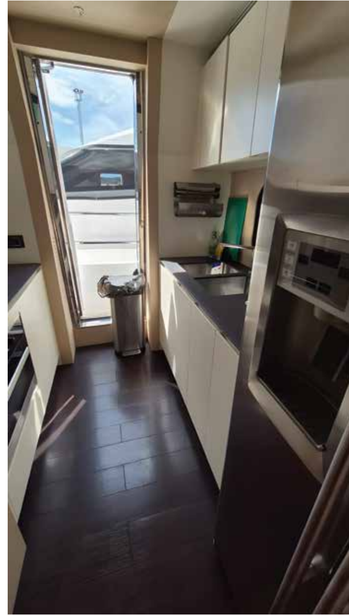
TWIN BEDROOM GALLEY